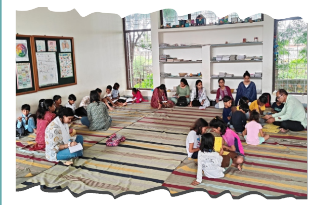
Jesus & Mary College Group

These visits are part of an ongoing collaboration where students regularly come to Digantar Vidyalaya to gain insights into its unique approach to education. The goal is to bridge the gap