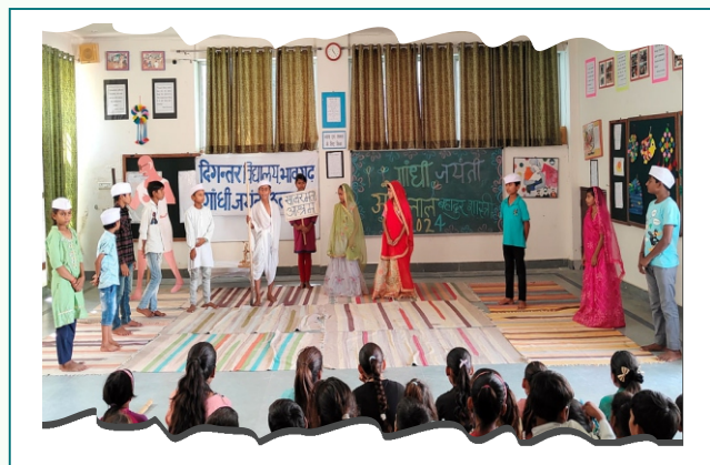
Gandhi Jayanti celebration, 2nd October

On 31st December, a get-together was held among all the Digantar members at the Vidyalaya to celebrate the upcoming New Year 2025.