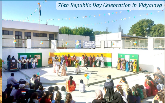
76th Republic Day Celebration in Vidyalaya

Digantar Shiksha Evam Khelkud Samiti, established in 1978, is a non-governmental, non-profit organization dedicated to improving education. Digantar operates two schools—a primary school in Kho Raibariyan with 50 students and 2 teachers, and another in Bhavgarh Bandhya with 180 students and 10 teachers. These schools not only provide quality education to underprivileged children but also serve as training sites for education professionals and student-teachers. They act as practical sites where innovative educational practices and theoretical perspectives are implemented and observed. TARU, a core part of Digantar, conducts training programs for teachers and educational workers, organizes short-term courses and workshops, and engages in research and material development. Through capacity-building initiatives, TARU promotes meaningful educational practices, contributing to educational theory, discourse, and teacher professional development, drawing from its extensive field experience.